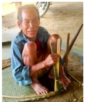
Population: 500 World Popl: 500 Total Countries: 1

People Cluster: Mon-Khmer Main Language: Katu, Western Main Religion: Ethnic Religions