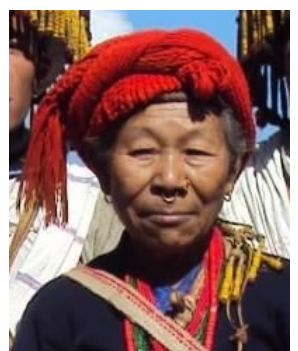
Population: 3,300 World Popl: 3,300 Total Countries: 1

People Cluster: South Asia Hindu - other