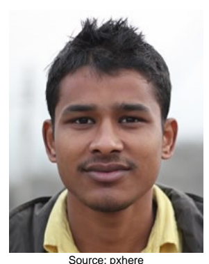
Population: 66,000 World Popl: 13,288,200