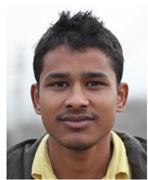
Population: 66,000 World Popl: 13,288,200 Total Countries: 59