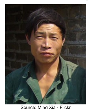
Population: 1,302,000 World Popl: 15,946,400 Total Countries: 64 People Cluster: Chinese

Main Language: Chinese, Mandarin Main Religion: Ethnic Religions Status: Partially reached