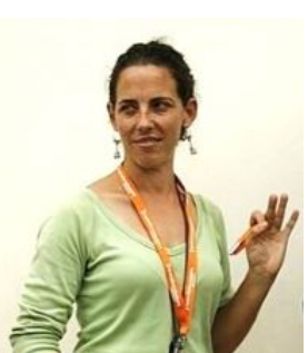
"Declare His glory among the nations." Psalm 96:3

Population: 210,000 World Popl: 51,182,460 Total Countries: 216 People Cluster: Deaf