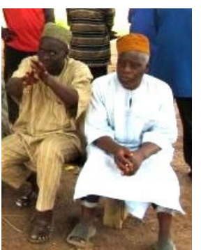
Population: 8,600 World Popl: 8,600 Total Countries: 1 People Cluster: Benue Main Language: Kyoli Main Religion: Christianity