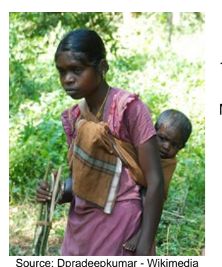
World Popl: 4,800 Total Countries: 1