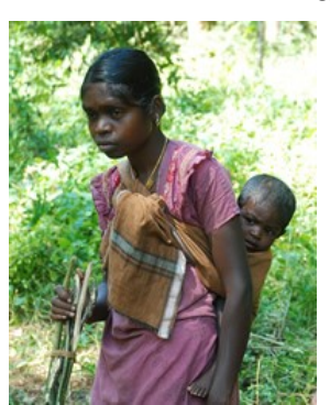
Population: 4,800 World Popl: 4,800 Total Countries: 1

People Cluster: South Asia Tribal - other