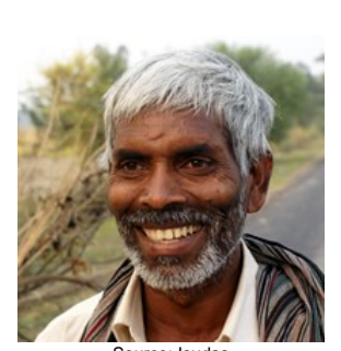
Population: 1,600 World Popl: 1,600 Total Countries: 1

People Cluster: South Asia Dalit - other