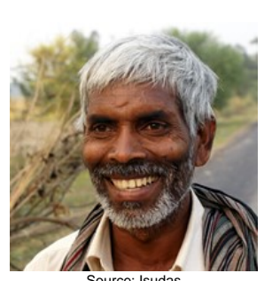
Population: 1,600 World Popl: 1,600