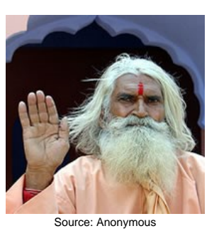
Total Countries: 3 People Cluster: South Asia Hindu - other