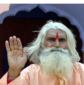
World Popl: 1,595,200 Total Countries: 3

People Cluster: South Asia Hindu - other