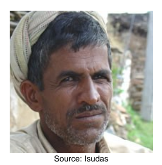
Population: 818,000 World Popl: 818,000 Total Countries: 1

People Cluster: South Asia Hindu - other