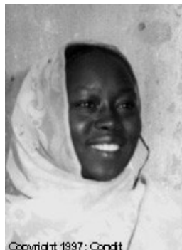
Copyright 1997: Condit Source: Bethany World Prayer Center

Population: 114,000 World Popl: 114,000 Total Countries: 1 People Cluster: Nilotic Main Language: Gaam Main Religion: Islam Status: ■ Unreached Evangelicals: 0.10% Chr Adherents: 0.50% Scripture: Unspecified