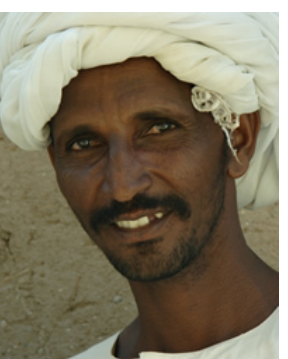
Population: 700 World Popl: 18,691,800 Total Countries: 19 People Cluster: Arab, Sudan