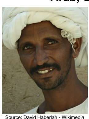
Population: 2,032,000 World Popl: 19,600,100 Total Countries: 19

People Cluster: Arab, Sudan Main Language: Arabic, Sudanese