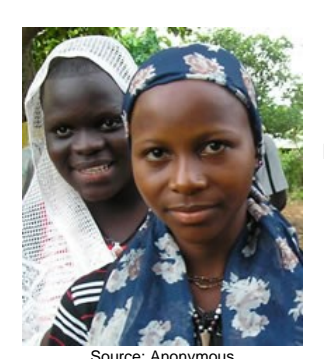
Population: 357,000 World Popl: 357,000 Total Countries: 1 People Cluster: Guinean Main Language: Gbe, Saxwe Main Religion: Christianity