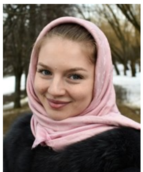
Population: 12,000 World Popl: 136,010,200