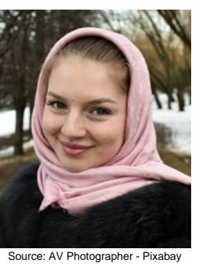
Population: 12,000 World Popl: 136,010,200 Total Countries: 71

People Cluster: Slav, Eastern Main Language: Russian Main Religion: Christianity