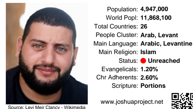
Population: 4,947,000 World Popl: 11,868,100 Total Countries: 26