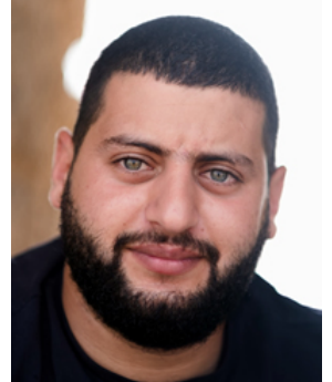
Total Countries: 26 People Cluster: Arab, Levant Main Language: Arabic, Levantine Main Religion: Islam Status: • Unreached