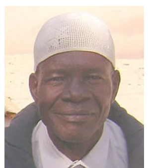
Population: 1,695,000 World Popl: 1,923,000