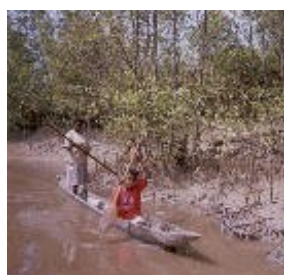
Papua

Population: 400 World Popl: 400 Total Countries: 1 People Cluster: New Guinea Main Language: Mombum Main Religion: Christianity Status: ■ Partially reached Evangelicals: 4.0% Chr Adherents: 55.0% Scripture: Unspecified