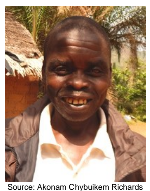
Population: 4,600 World Popl: 22,600 Total Countries: 2 People Cluster: Benue Main Language: Iceve-Maci Main Religion: Ethnic Religions Status: Partially reached

Evangelicals: 8.0% Chr Adherents: 45.0% Scripture: Portions