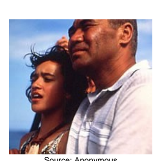
Population: 661,000 World Popl: 674,700 Total Countries: 3

People Cluster: Polynesian Main Language: Maori Main Religion: Christianity