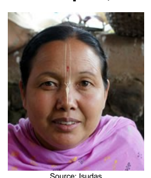
Population: 12,000 World Popl: 1,650,000