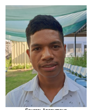
Population: 166,000 World Popl: 166,000 Total Countries: 1 People Cluster: Timor Main Language: Mambae Main Religion: Christianity

Status: Partially reached Evangelicals: 2.3% Chr Adherents: 99.0% Scripture: Portions