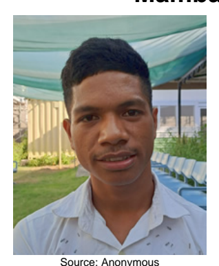
Population: 166,000 World Popl: 166,000 Total Countries: 1 People Cluster: Timor Main Language: Mambae Main Religion: Christianity