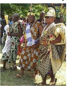
World Popl: 288,000 Total Countries: 2 People Cluster: Guinean Main Language: Ikposo Main Religion: Christianity