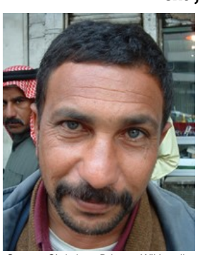
Population: 325,000 World Popl: 22,340,000 Total Countries: 24 People Cluster: Arab, Levant