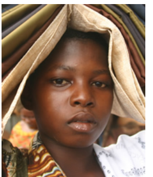
Population: 9,700 World Popl: 4,161,700