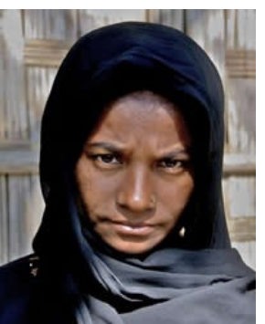
Population: 58,000 World Popl: 2,194,600 Total Countries: 9

People Cluster: South Asia Muslim - other