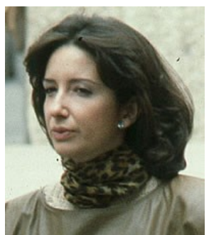
World Popl: 52,106,590 Total Countries: 113 People Cluster: French Main Language: French Main Religion: Christianity