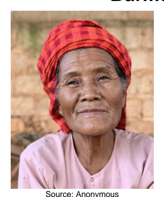
Population: 213,000 World Popl: 32,180,600 Total Countries: 18 People Cluster: Burmese Main Language: Burmese Main Religion: Buddhism Status: Unreached

Evangelicals: 0.42% Chr Adherents: 0.50%