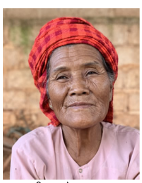
Population: 2,500 World Popl: 32,120,100 Total Countries: 18 People Cluster: Burmese Main Language: Burmese Main Religion: Buddhism Status: Unreached

Evangelicals: 0.20% Chr Adherents: 0.60%