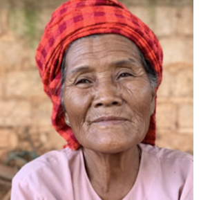
"Declare His glory among the nations." Psalm 96:3