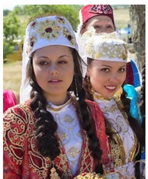
Population: 6,100 World Popl: 6,046,800 Total Countries: 54 People Cluster: Armenian