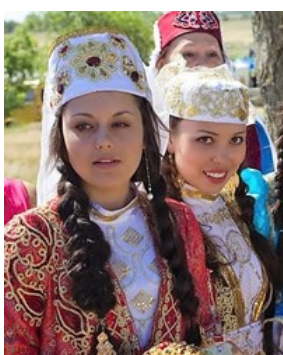
Population: 6,100 World Popl: 6,046,800 Total Countries: 54 People Cluster: Armenian