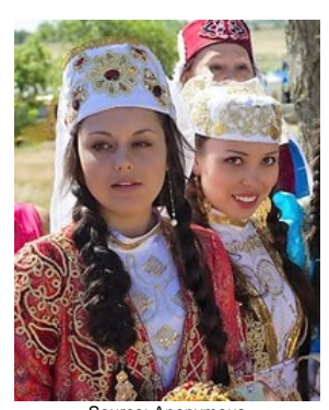
Population: 6,100 World Popl: 6,046,800 Total Countries: 54 People Cluster: Armenian

Main Language: Armenian, Western Main Religion: Christianity