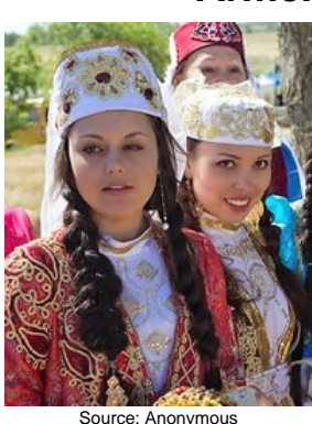
Population: 6,100 World Popl: 6,046,800 Total Countries: 54 People Cluster: Armenian