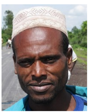
Population: 448,000 World Popl: 448,000 Total Countries: 1