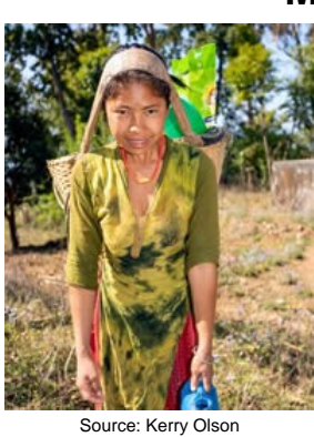
Population: 426,000 World Popl: 2,645,300