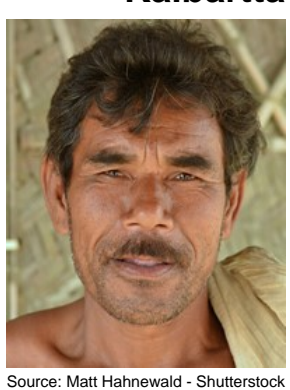
Population: 1,649,000 World Popl: 1,906,200