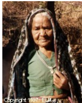
Copyright 1997. ELLI Source: Bethany World Prayer Center

Population: 480,000 World Popl: 486,700 Total Countries: 2 People Cluster: South Asia Tribal - other Main Language: Gamit Main Religion: Hinduism Status: ● Minimally Reached Evangelicals: Unknown % Chr Adherents: 10.34% Scripture: New Testament