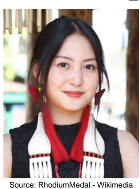
World Popl: 212,000 Total Countries: 1

People Cluster: South Asia Tribal - Naga