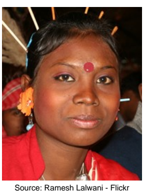
Population: 4,403,000 World Popl: 4,463,100