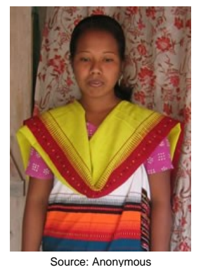
Population: 174,000 World Popl: 187,000 Total Countries: 2

People Cluster: South Asia Tribal - other