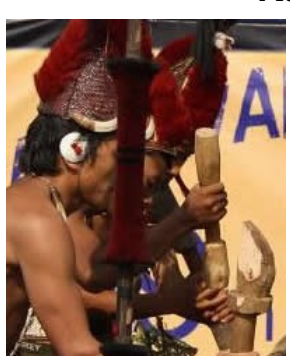
Population: 64,000 World Popl: 64.000

Main Language: Naga, Phom Main Religion: Christianity