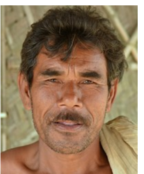
Population: 1,649,000 World Popl: 1,906,200