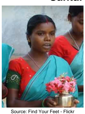
Population: 9,026,000 World Popl: 9,306,400