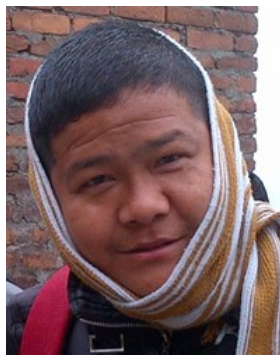
Population: 131,000 World Popl: 758,100 Total Countries: 4