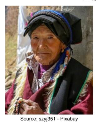
Population: 112,000 World Popl: 1,126,900 Total Countries: 14 People Cluster: Tibetan

Main Language: Tibetan, Central Main Religion: Buddhism Status: Unreached Evangelicals: Unknown % Chr Adherents: 0.28%