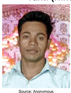
Population: 5,629,000 World Popl: 6,274,000