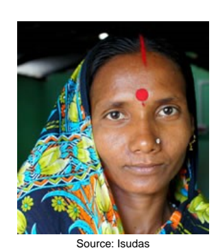
Population: 1,279,000 World Popl: 1,630,000