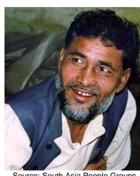
Source: South Asia People Groups

Population: 11,000 World Popl: 803,000 Total Countries: 3 People Cluster: South Asia Muslim - other Main Language: Urdu Main Religion: Islam Status: ☀ Frontier Unreached Evangelicals: 0.00% Chr Adherents: 0.00% Scripture: Complete Bible