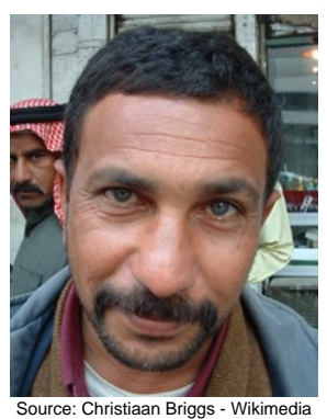
Population: 22,000 World Popl: 22,370,300