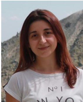
Source: Български език - Български език - Български език

Population: 900 World Popl: 6,652,600 Total Countries: 41 People Cluster: Slav, Southern Main Language: Bulgarian Main Religion: Christianity Status: ● Superficially reached Evangelicals: 1.8% Chr Adherents: 60.0% Scripture: Complete Bible www.joshuaproject.net