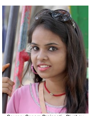
Population: 307,000 World Popl: 2,810,100