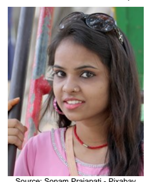
Population: 97,000 World Popl: 2,810,100 Total Countries: 17