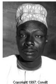
Copyright 1997: Condit Source: Bethany World Prayer Center

Population: 8,100 World Popl: 160,700 Total Countries: 3 People Cluster: Chadic Main Language: Buduma Main Religion: Islam Status: ● Unreached Evangelicals: 1.00% Chr Adherents: 1.00% Scripture: Portions