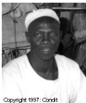
Copyright 1997: Condit Source: Bethany World Prayer Center

Population: 155,000 World Popl: 155,000 Total Countries: 1 People Cluster: Chadic Main Language: Warji Main Religion: Islam Status: ● Partially reached Evangelicals: 10.0% Chr Adherents: 20.0% Scripture: Portions