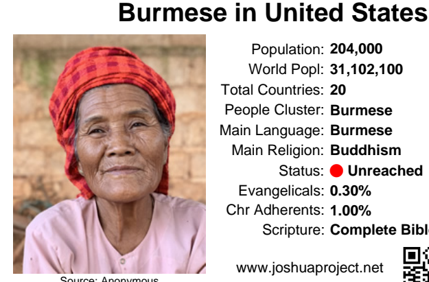
Population: 204,000 World Popl: 31,102,100 Total Countries: 20 People Cluster: Burmese

Main Language: Burmese Main Religion: Buddhism Status: • Unreached Evangelicals: 0.30%