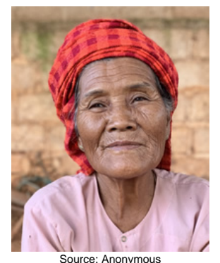
Population: 110,000 World Popl: 31,102,100 Total Countries: 20 People Cluster: Burmese Main Language: Burmese Main Religion: Buddhism Status: Unreached Evangelicals: 0.08% Chr Adherents: 0.30%