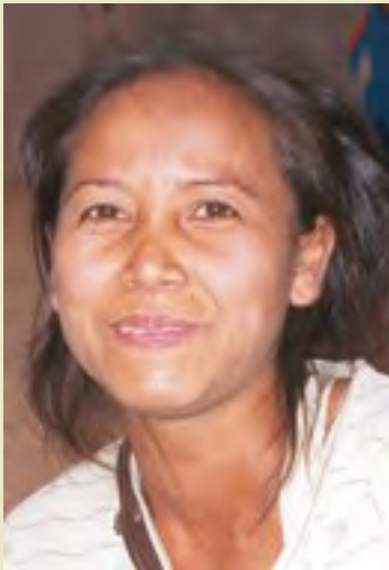
Peoples of Laos, Paul Hattaway © photo used with permission

Some of the Oy live in 21 villages on the fertile Boloven Plateau region of southern Laos and others live at the foot of the plateau. Many of the Mon Khmer groups in the south are grouped together so that the Oy live intermingled with Brau and Ngae peoples. In some ways the Oy are adopting the culture of their neighbors they still cling to ancestor worship rather than accepting Buddhism. Except for the more isolated communities, they do not practice animistic ceremonies except in times of crisis. Then the rituals resume.