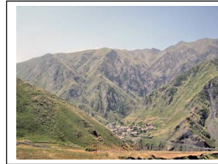
Village of Gdiim