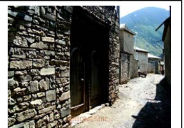
Internal view of Khryoog --with its narrow village streets