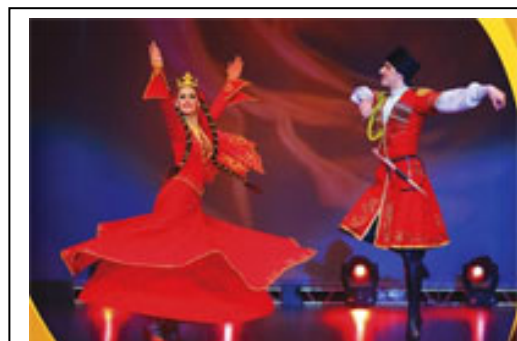
The Lezginka danced on an international stage

* PRAY for the Lezgi believers to shine as bright lights in the midst of their Lezgi families & clans. Phil.2:12-15 * PRAY for men and women of peace ( Luke 10:6 ) in each one of the 142+ Lezgi towns & villages, to be keys to welcoming the love of God, the grace of Jesus, and the power of the Holy Spirit into each Lezgi community in the years ahead. Matthew 9:36-38 & Hebrews 2:3-4 * GIVE THANKS for the Translation Work which is underway. PRAY for wide reading! II Timothy 3:15-16 * PRAY for many Lezgi to dance, full of the joy of the Holy Spirit, in the years to come. Isaiah 55:11 * PRAY for the noble Lezgi culture to be graced with the Fruit of the Spirit in the next generation. Gal. 5:22-23