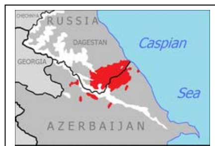
In Red - Lezgi home region - in southern Dagestan (Russia) & northern Azerbaijan.

In the 90 Lezgi towns and villages of Dagestan—see Page 2—the Lezgi raise sheep and goats, combined with subsistence agriculture, leather working, and textile production [famous hand woven carpets]. Life is similar in the more than 50 Lezgi towns and villages of northern Azerbaijan; with the exception that in Dagestan Russian serves as the 2 nd language, whereas Azeri is the 2 nd language for Lezgi in Azerbaijan. The Lezgi language, however, is alive and well—with robust oral activity in Lezgi villages, homes, and schools; and a huge reservoir of Lezgi literature and music. Many Lezgi have also out-migrated from rural Lezgi regions to urban areas of Dagestan and Azerbaijan, primarily for economic reasons. Patriarchal social structure among the Lezgi remains strong, especially in village life and in demarcated urban enclaves.