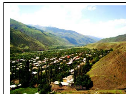
Lezgi Village of Khryoog